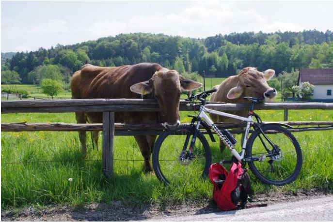
Somewhere between Graz and Weiz

After my studies ended in Graz, I decided to go to Belgrade in Serbia by bike and fly from there back to Finland. I made stops in Ptuj in Slovenia, Zagreb in Croatia, Gradiška in Bosnia and Novi Sad in Serbia. I used 10 days for the trip. The original plan was to go all the way by bike, but because of the ~40 C° heat I decided to go from Gradiška to Novi Sad by bus. Most of the nights I slept in hostels, but in Gradiška I stayed at a friend of mine who I also knew from the student dorm. It took 500 km on my bike and 250 km by bus to get the trip behind me, but it was an awesome challenge and experience of new places and people. An excellent way to end my exchange year.