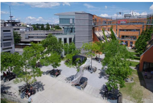
TU Graz at Inffeldgasse

I visited mostly courses from the faculty of electrical and information engineering. These were lectured at Inffeldgasse, one of the 3 sites of the TU Graz. It was about 3 km from my dorm and the easiest way to get there was by bike. Signing up for courses and exams was done with a system called “TUG Online”, which also served for E-mail, time schedules, room locations, completed studies etc. The lecturers were on almost all courses very good and the course material was of high quality. Many buildings at Inffeldgasse were or had just been under renovation, so many lecture halls and laboratories were new and well equipped. The university had also the biggest high voltage laboratory in Austria, named after Nikola Tesla.