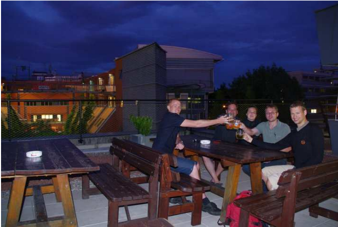
Stopping by for a beer at the balcony of Hochspannungszeichensaal after a lab course

There was also a common room for students of electrical engineering called “Hochspannungszeichensaal”. It had a kitchen (with a beertap ☺), computers, tables and space for studying and a balcony. I did often go there between lectures to eat, or in the evenings to meet people and to have a beer after the day.