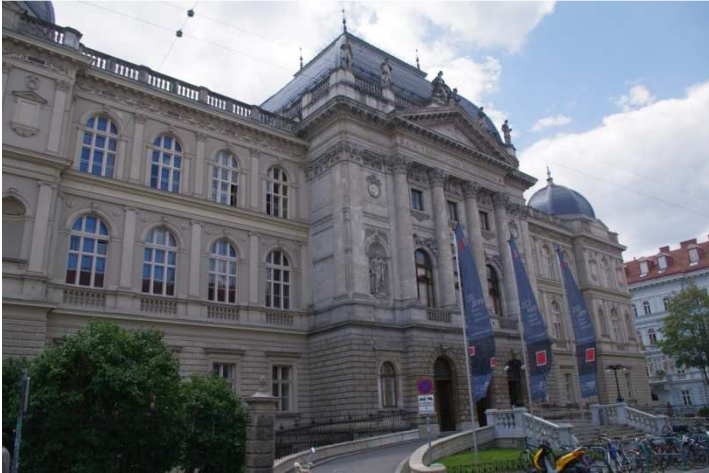
Main building of the TU Graz

The Graz University of Technology has about 9000 students, was founded in year 1811 and has 7 faculties.