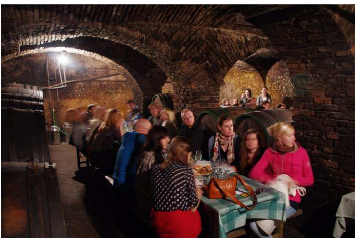
Winetasting in a cellar of the Liener winefarm

I joined a trip of the ESN organization called “Weinroute”. It was a one day drive with a bus trough the wine region of Styria. We visited some local wine farms, made some wine tastings and ate very good traditional food. I would absolutely recommend this trip for anyone!