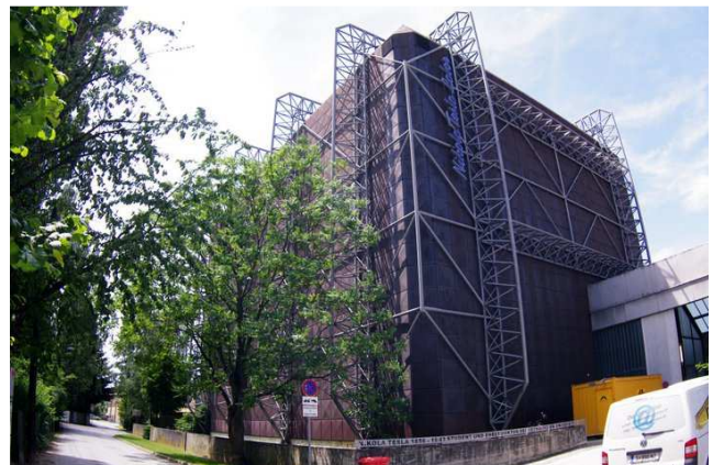
Nikola Tesla Laboratory