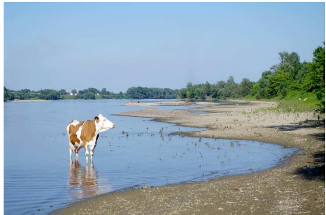
A cow taking a bath in the Sava river in Gradiška, Bosnia.