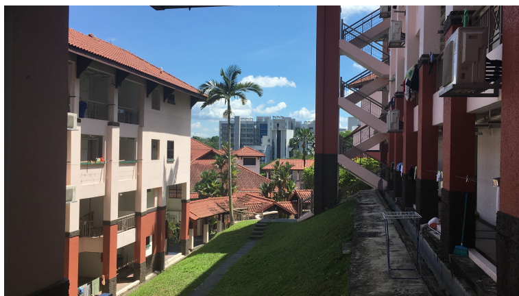
NTU Hall 10

It was relatively easy to live cheaply in Singapore, as the food in the so called “Hawker Centers” or “Foodcourts” are very affordable and delicious. One of the things about Singapore that I will miss the most, is the fact that you don’t have to cook your food every day. I lived in a hall called “Hall 10” which consisted of several blocks of shared rooms with a shared kitchen and toilets for every floor. The kitchen was not meant for cooking, only for heating up instant noodles or making oatmeal if you are a Finn like me. You didn’t even have to heat up the water as there was boiling-hot water coming from a tap in the kitchen - how convenient.